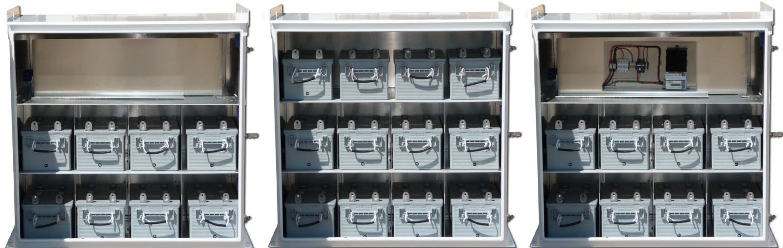
(8) Battery Bank : 8G8D