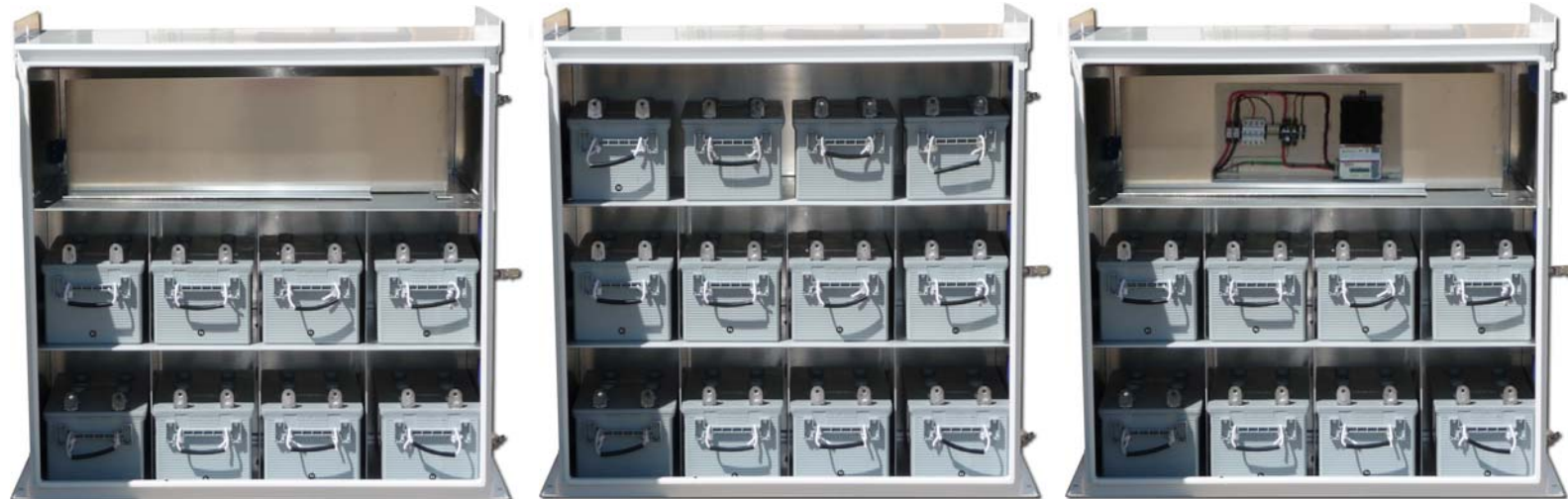
(8) Battery Bank : 8G8D