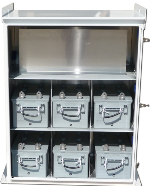
(6) Battery Bank : 8G8D