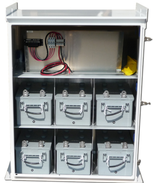
Back Panel Assembly