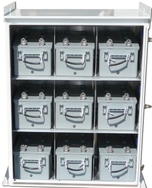
(9) Battery Bank : 8G8D