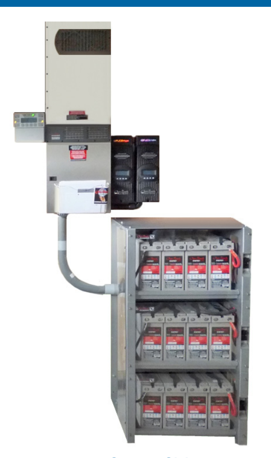
System Sizing Please give us a call for exact system sizing. 1-855-43-SOLAR

Our battery backup systems allow you to power loads on your dedicated load center in the event of an electrical outage.