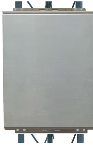
Mounts to ROHN25 tower using 4 u-bolts (Bolts not included)