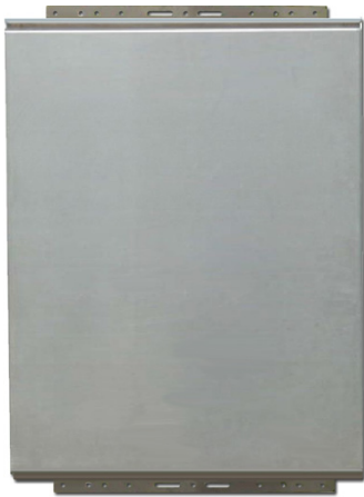
Mounts on wall using 4 lag bolts (Bolts not included)