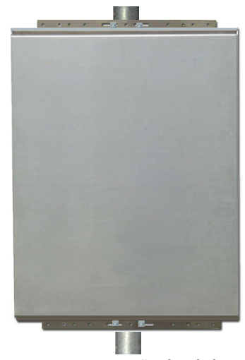
Mounts to 2-3" schedule 40 pole using 2 u-bolts (Bolts not included)