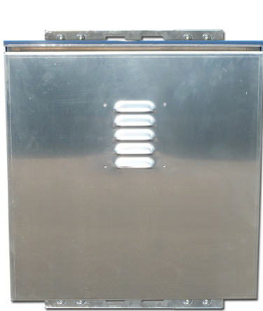
Mounts on wall using 4 lag bolts (Bolts not included)