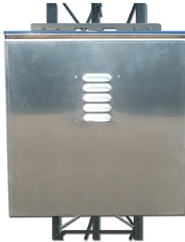
Mounts to ROHN25 tower using 4 u-bolts (Bolts not included)