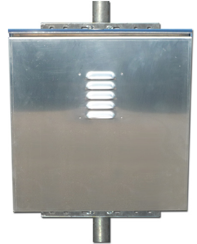
Mounts to 2-3" schedule 40 pole using 2 u-bolts (Bolts not included)