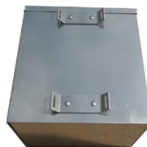
Banding available for unique mounting structures