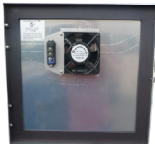
Door fans available in 12V, 24V, and 48V DC/120V AC